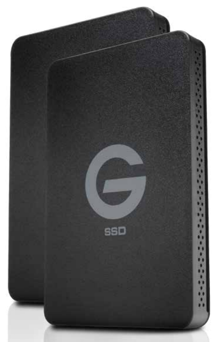
G-DRIVE ® ev RaW SSD