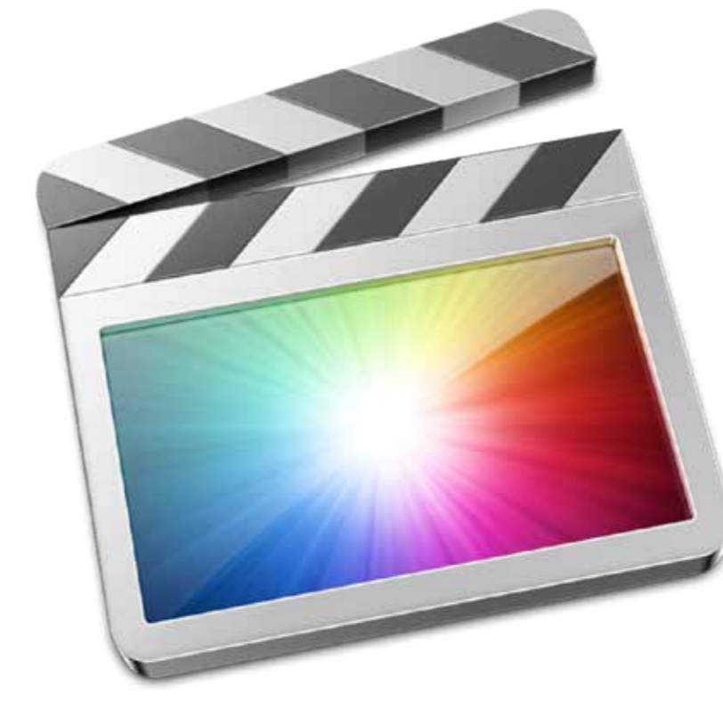
FINAL CUT PRO X