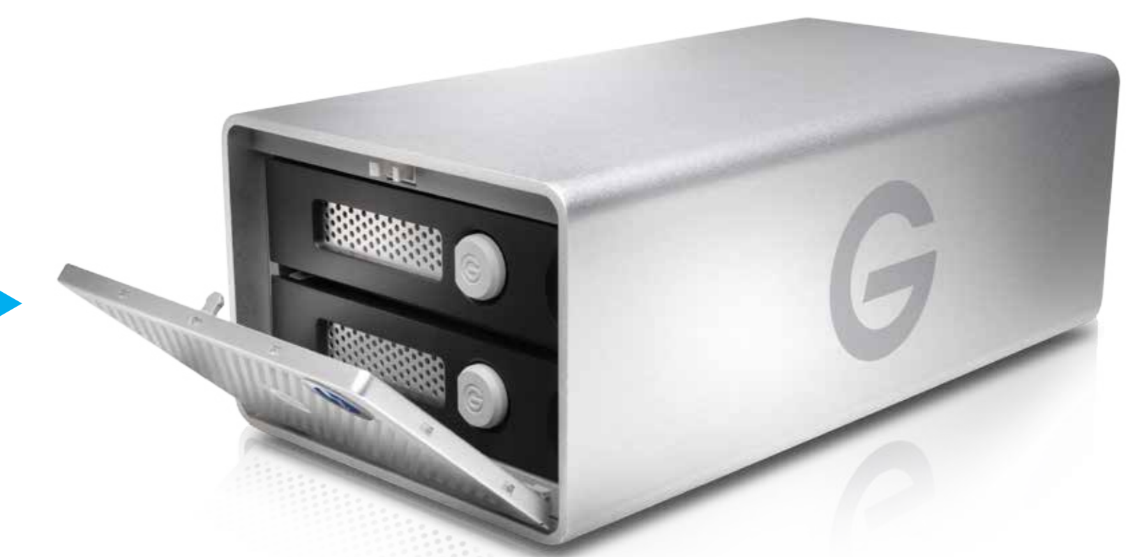
G-RAID ® with Thunderbolt ™