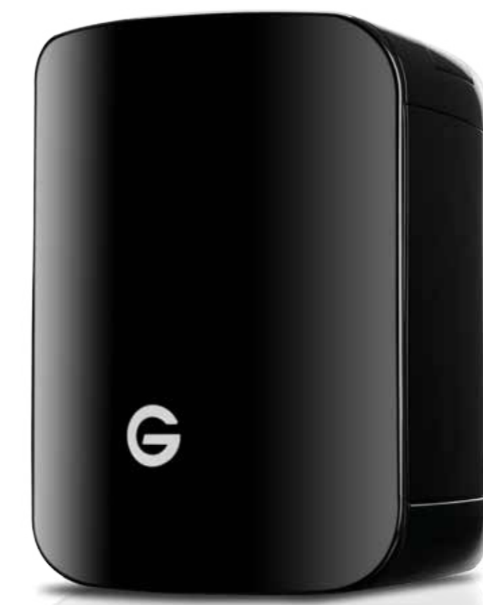
G-SPEED ® STUDIO ™ with Thunderbolt ™