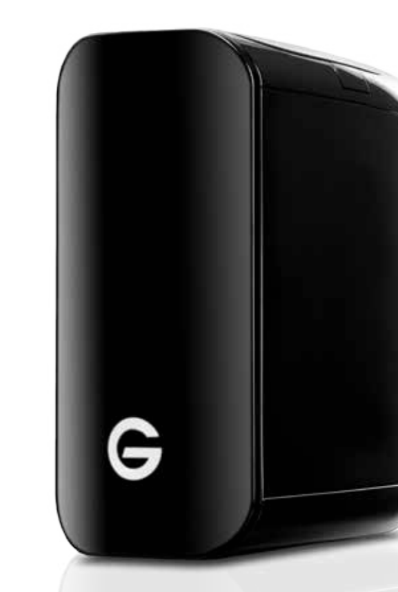
G-RAID ® STUDIO ™ with Thunderbolt ™