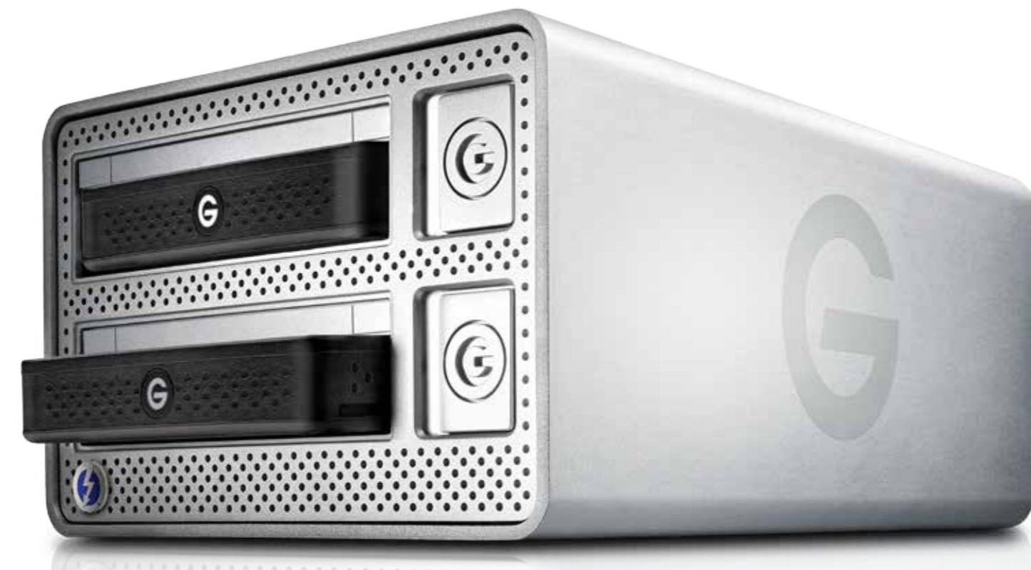
G-DOCK ® ev ™ with Thunderbolt ™