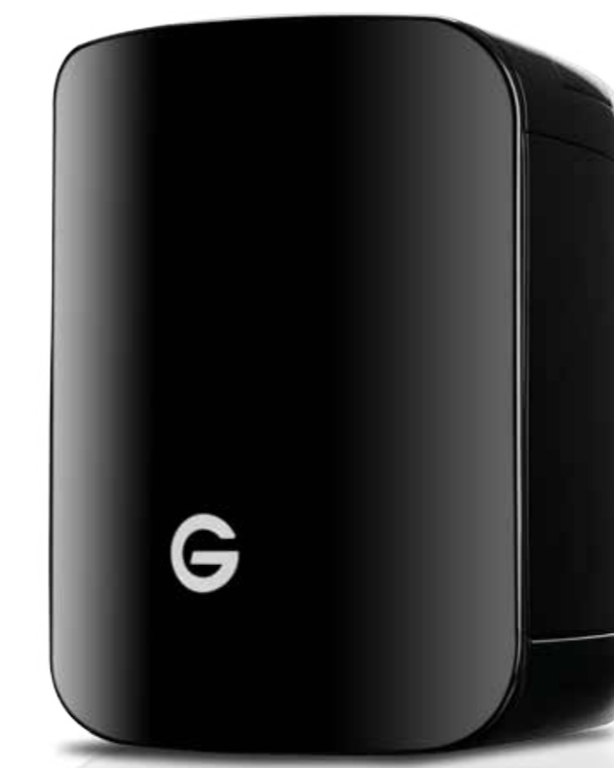
G-SPEED ® STUDIO ™ with Thunderbolt ™