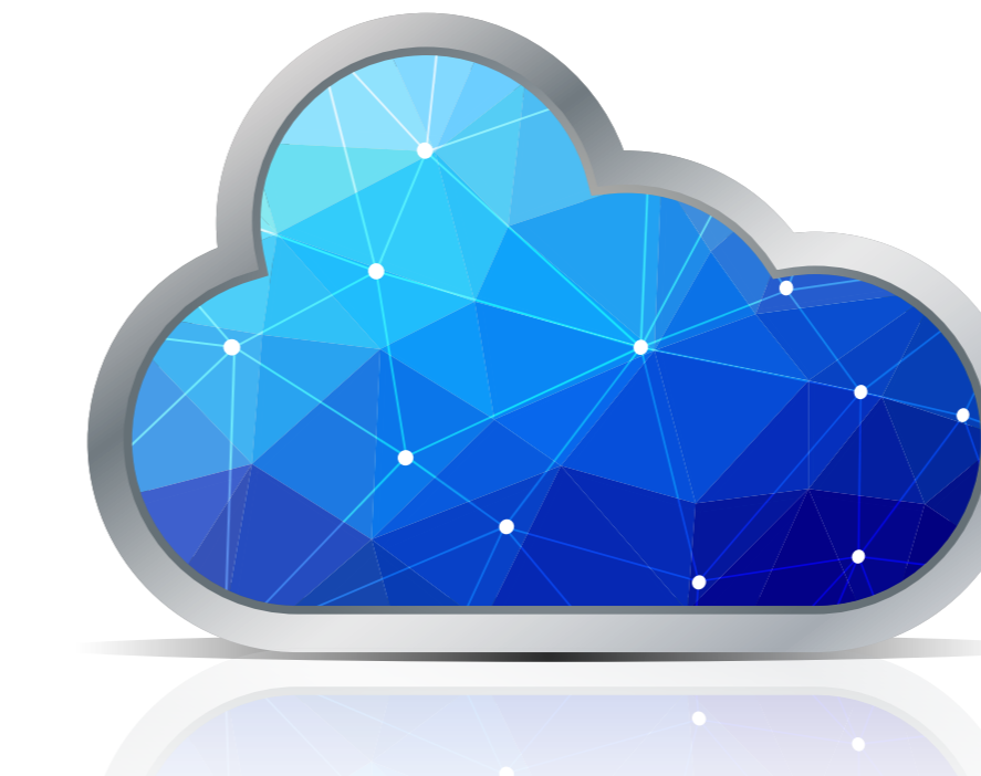
SELECT IMAGES/VIDEO CLIPS ACTIVE DATA TRANSFER