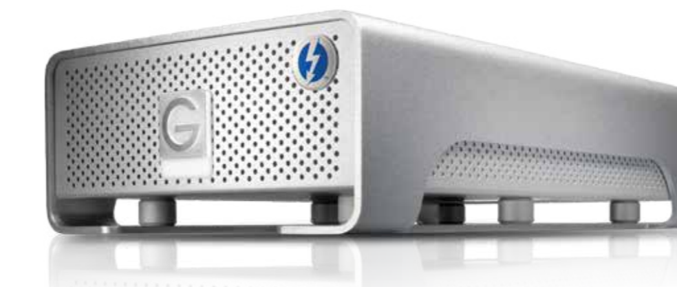
G-DRIVE ® PRO ™ with Thunderbolt ™